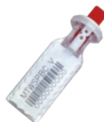
Mega Twister Vertical