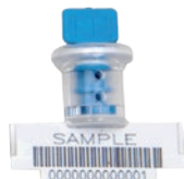
Mega Twister SP BC