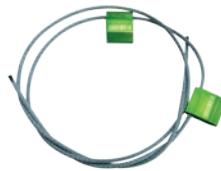
Mega Cable Lock