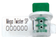
Mega Twister SP