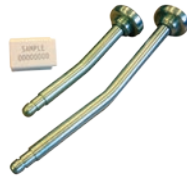
Mega Rail Bolt