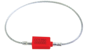
Carrier Cable Seal 350