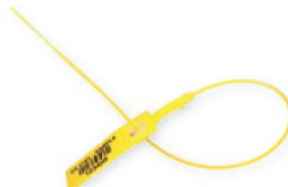
ES 414 L+S