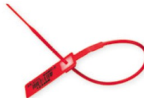
ES 411 L+S