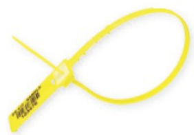
ES 412 L+S